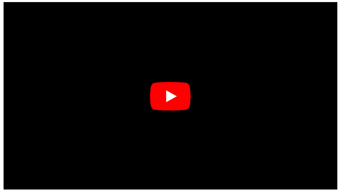
The Characters of The Wonderful Wizard of Oz

The Wonderful Wizard of Oz features a cast of unforgettable characters. Dorothy is a kind and compassionate girl who is always willing to help others. The Scarecrow is a wise and intelligent scarecrow who is always looking for knowledge. The Tin Man is a gentle and kind-hearted tin man who is always looking for a heart. The Cowardly Lion is a brave and courageous lion who is always looking for courage.