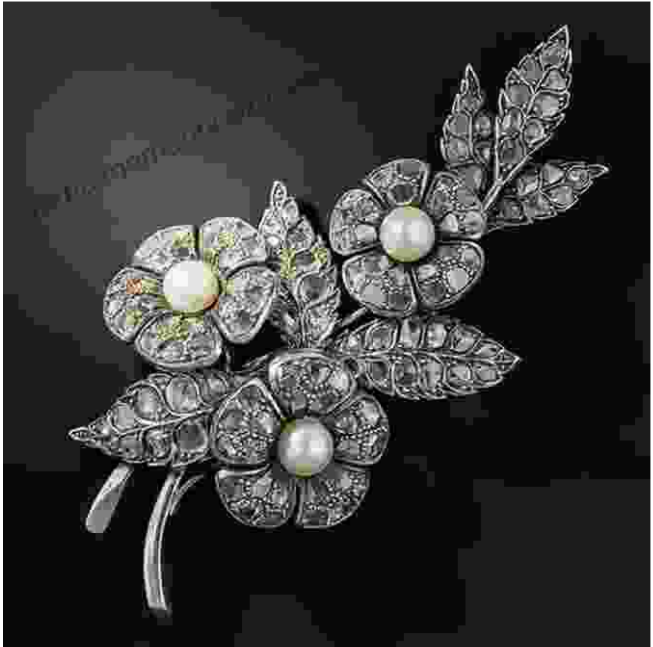
A stunning diamond brooch, a masterpiece of Victorian jewelry design.