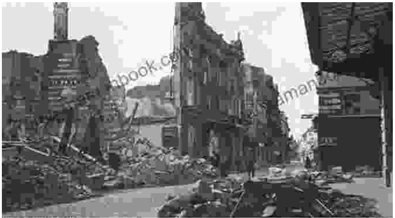
AUSTRIAN WAR MEMORIAL