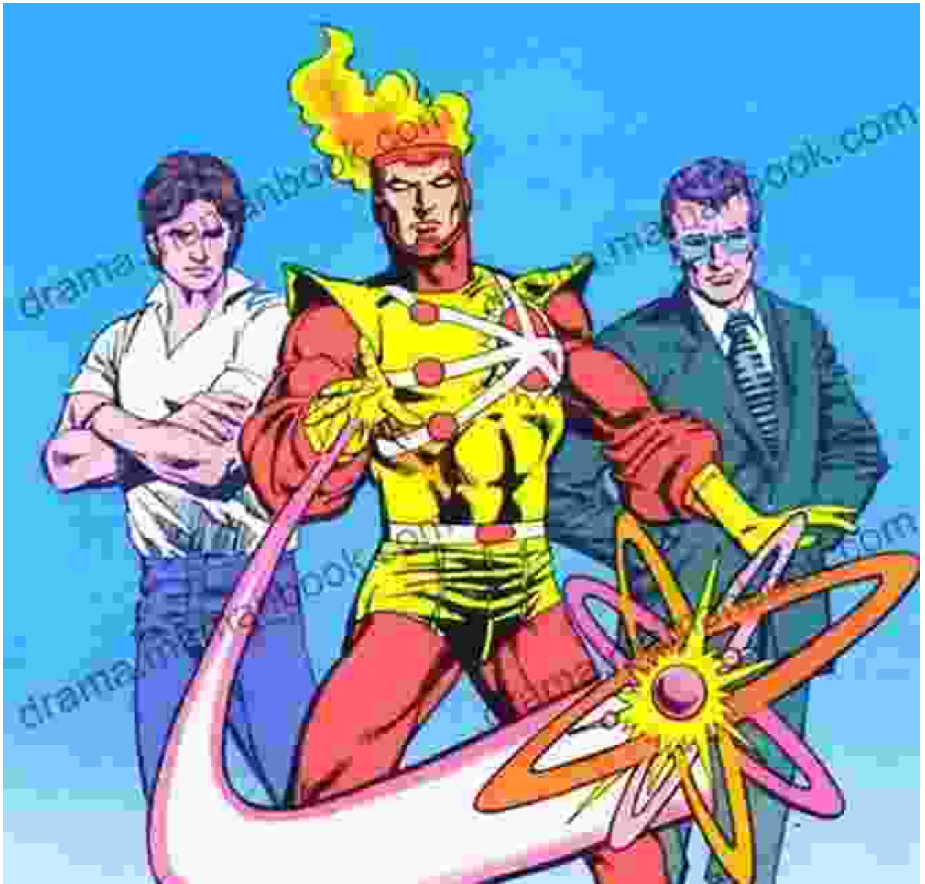
Firestorm and Professor Martin Stein